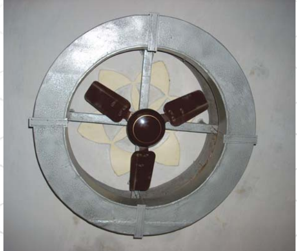
HARYANA INNOVATES | 12