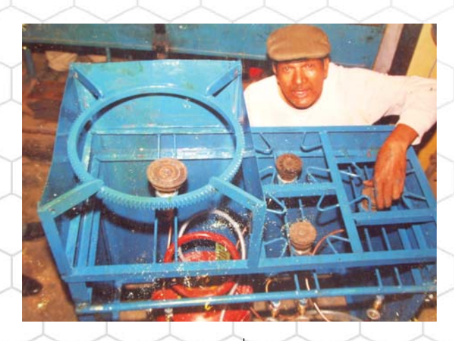
HARYANA INNOVATES 23

Using locally available standard components, this ingenious device uses a standard drum into which the washed and soaked potatoes are loaded from the top. The rotation of the base of drum makes the potatoes come in contact with walls coated with textured sandpaper. The arrangement facilitates removal of the peels effectively. The peeled potatoes exit from the chute located at the side of the drum, which are then washed to remove any impurities.