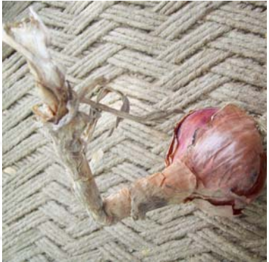
HARYANA INNOVATES 27