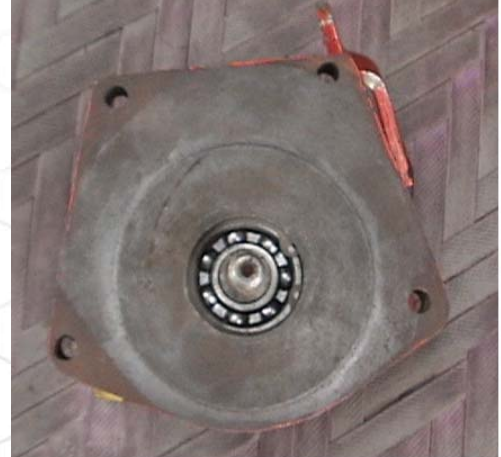
HARYANA INNOVATES 24