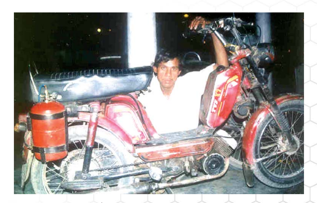
HARYANA INNOVATES | 14

He has developed a gas powered moped unit using a small LPG cylinder at the rear and a custom gas kit with a specialized valve that prevents back flow of gas or damage due to sparks in the carburetor. The low running cost and manageable weight of the small cylinder at back are some of the highlights of this innovation.