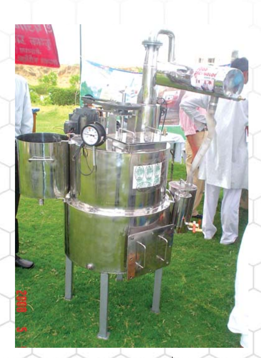
HARYANA INNOVATES 19

With this device, the innovator uses the specially designed pressure cooking chamber to extract the essence from Aloe Vera. Being a compact portable unit, it can be quickly and easily transported and used anywhere, to process herbs and deliver on demand. The present machine has a capacity to process 100 kg of Aloe Vera per hour.